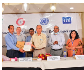
MoA signing between EESL and Total Drugs & Intermediates Private Limited.