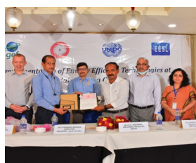
MoA signing between EESL and Gensynth Laboratories Private Limited.