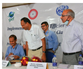
MoA signing between EESL and Vega Life Sciences Private Limited.