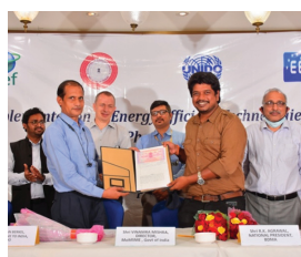
MoA signing between EESL and Virupaksha Organics Private Limited.