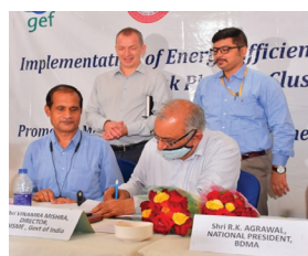
Signing of MoU with EESL and BDMA