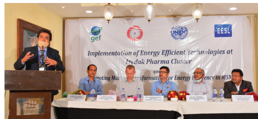
RD Hyderabad NPC team addressing the participants